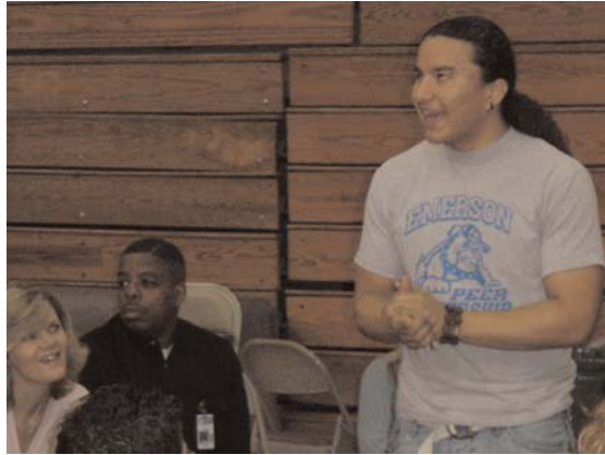
A peer leader at Emerson High School conducts an activity with parents at Family Night.

extraordinary dedication when they agreed to partner with PCLT and Rutgers University for a comprehensive evaluation of PGC. One element of this partnership entails weekly observation of EHS faculty and students by PCLT and Rutgers University staff. Intensive data on every aspect of their program is being collected.