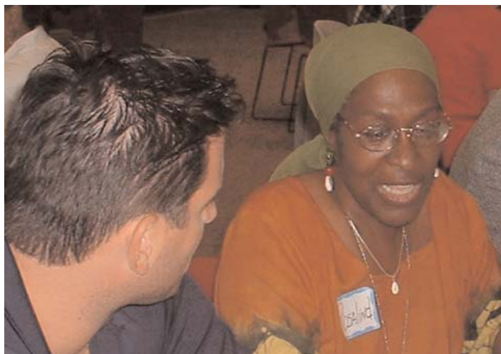
Newark Central Office staff and high school administrators were able to discuss and set their educational priorities for the 2005-06 school year at the August 2005 Leadership Conference facilitated by PCLT staff.